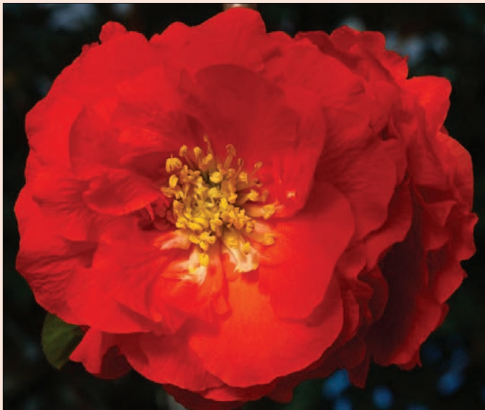
Chaenomeles speciosa 'Orange Storm'

Chaenomeles speciosa 'Pink Storm' PPAF – A medium-sized, upright to rounded, multi-stemmed shrub with a mature height of approximately 6 feet. Large, 2 inches in diameter, pink, double